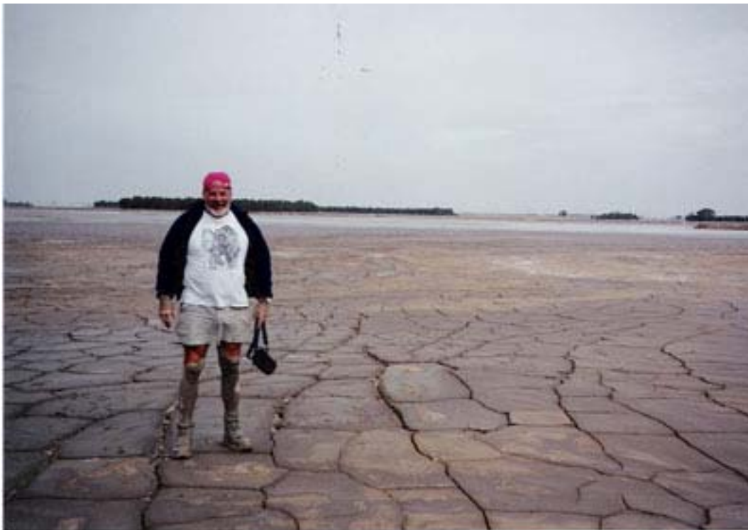
A lake of arsenic-laden mud to slog through – another seismic life bonus