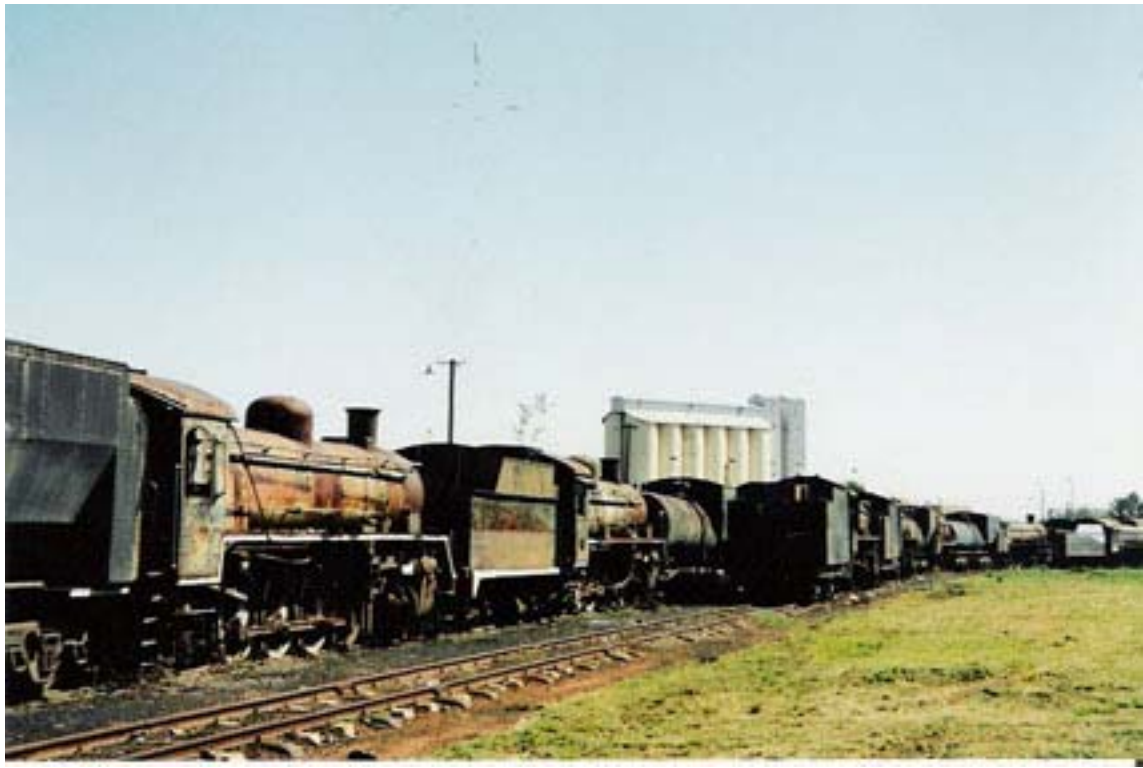
Steam train boneyard in Klerksdorp