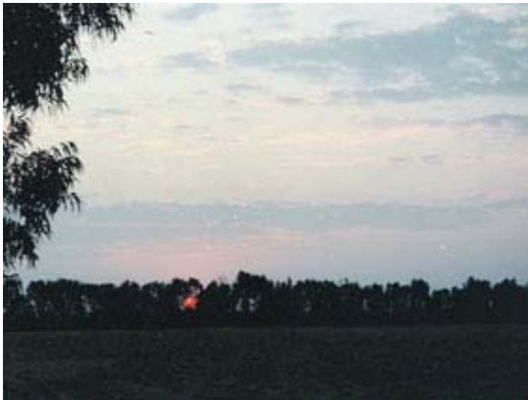
Evening sun disc through the trees