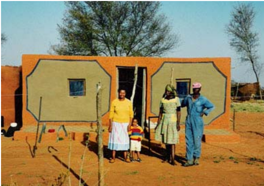
"Modern" homestead: I used to give this couple rides to church on Sundays in Klerksdorf