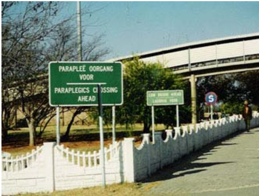
And, for some idea of how dangerous underground gold mining is, here is a sign at Anglo-American Mining Ltd's Mine #11