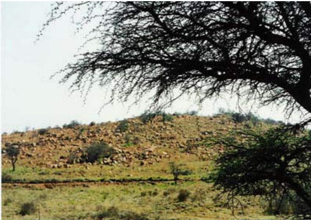
A kopje (head) of quartzite rock