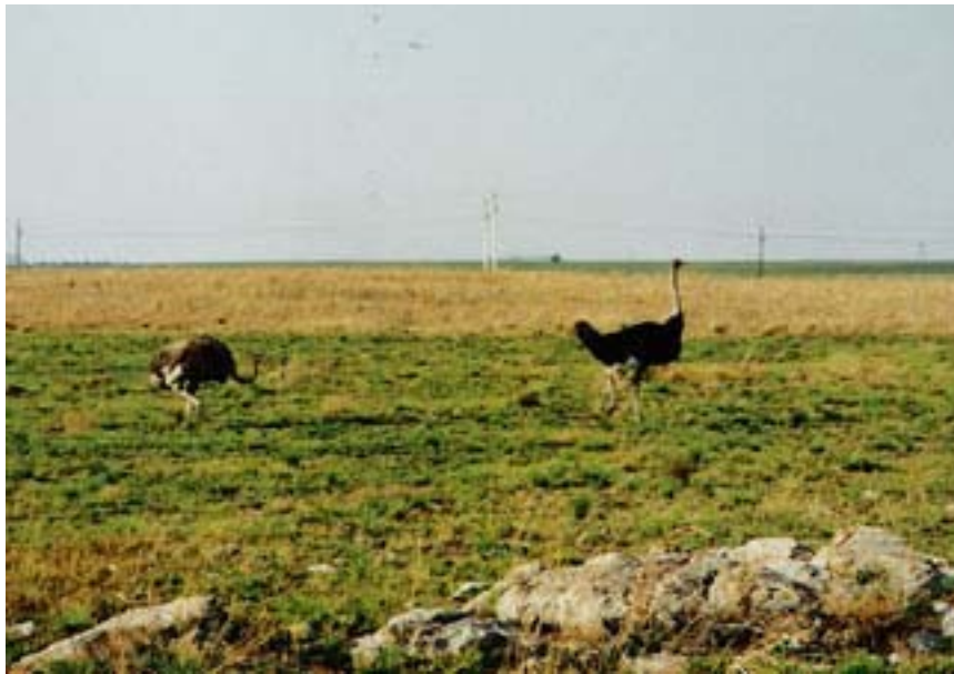
Chickens the size of horses