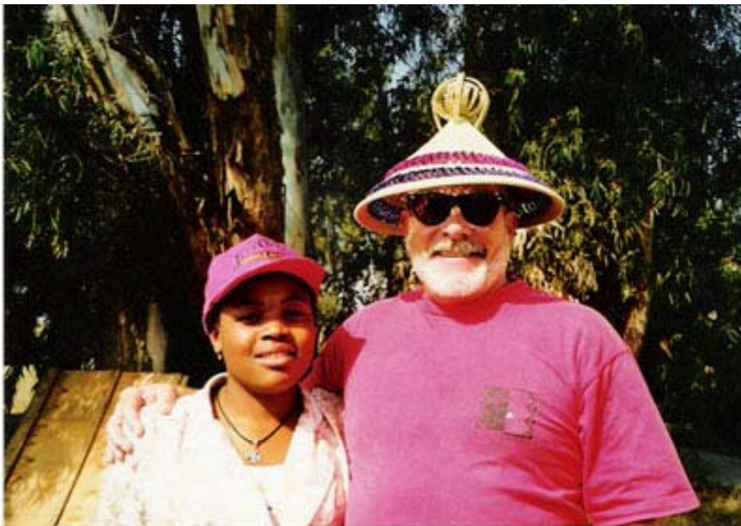
A pretty launderette with strange mzungu