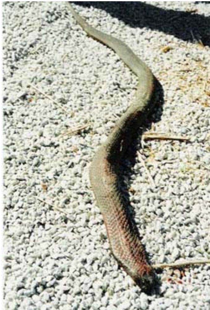
And effing cobras everywhere!