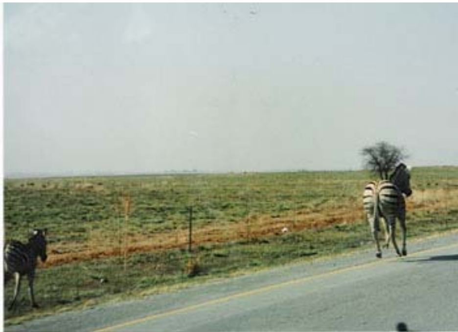
With strange-looking horses