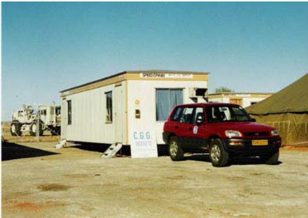
The office trailer near the town of Potchefstroom