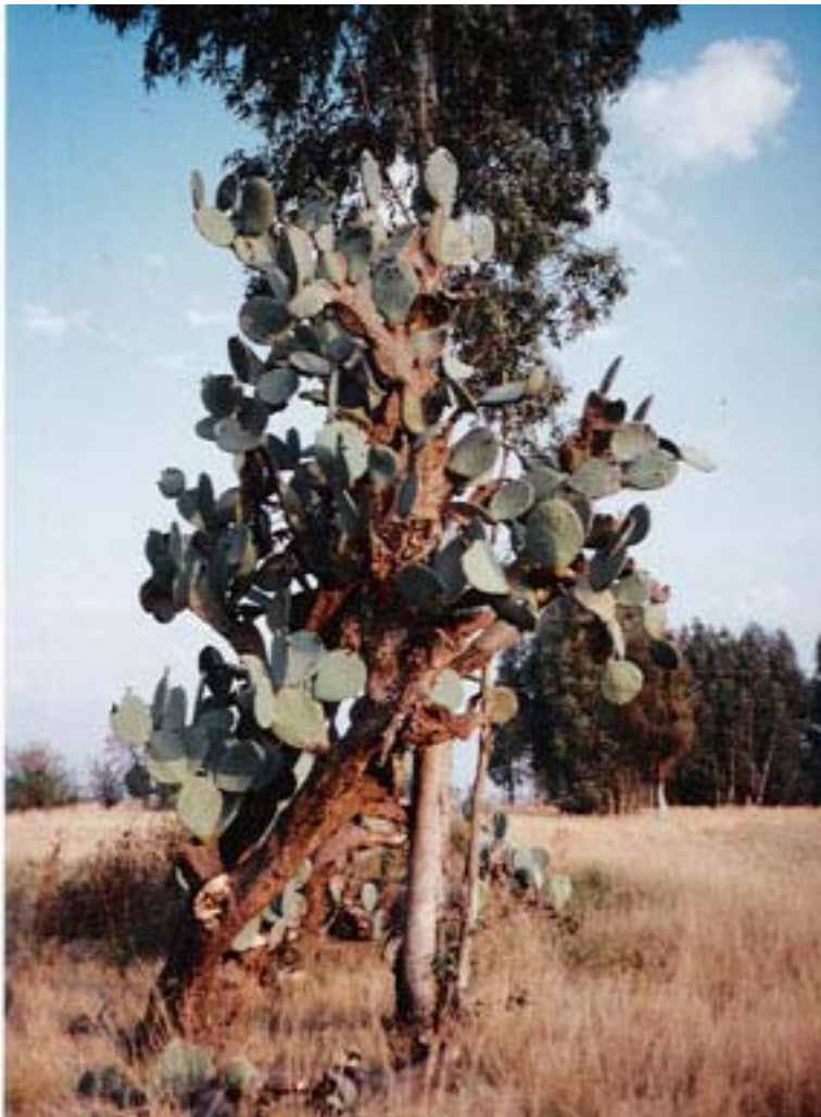
Cactus tree (native) and Eucalyptus tree (non-native) existing side-by-side, which makes a nice metaphor