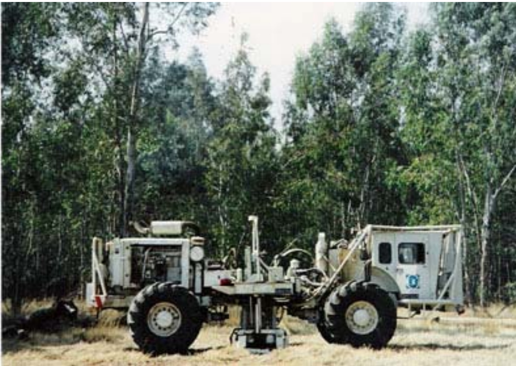
Vibe jobs are like being married and having kids while helicopter jobs are like finding a hot young lover two or three times a year – exciting