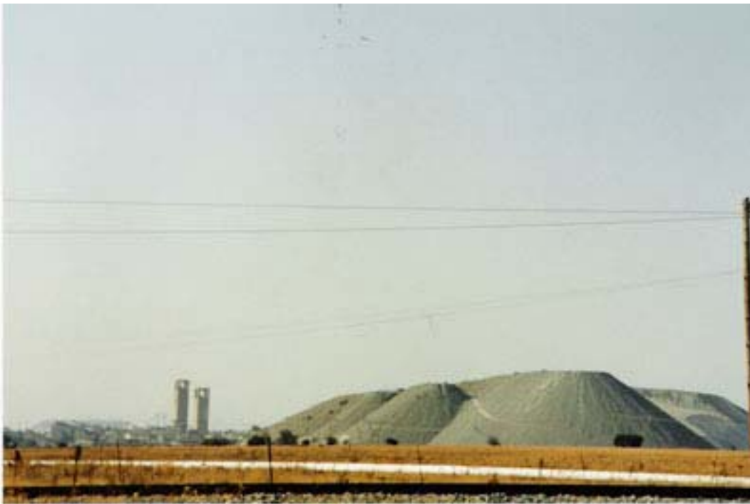
Enormously deep gold mines