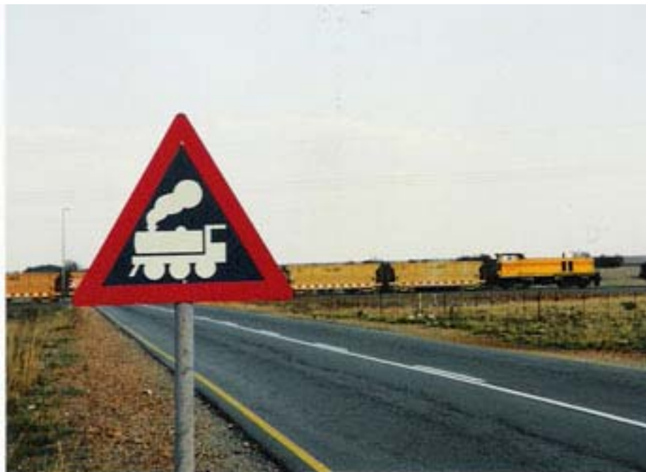
Trains of all kinds in SA