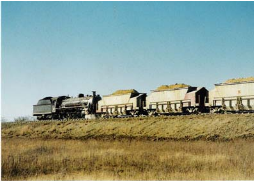
A puffer belly pushing ore cars to a processing mill