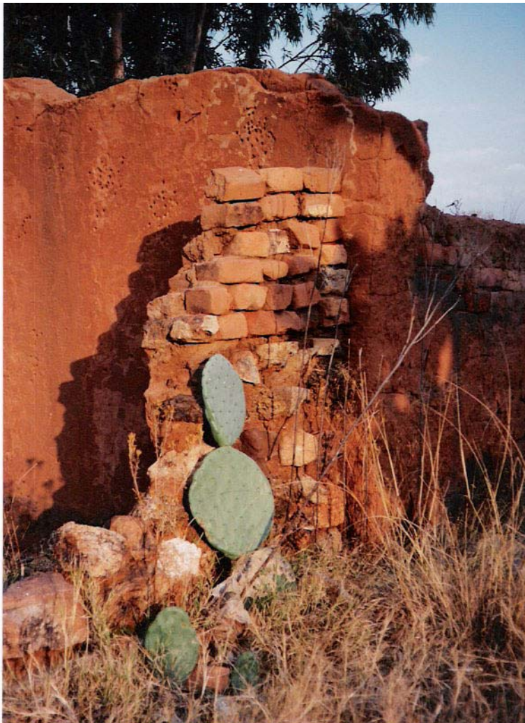
White pioneer effort being reclaimed by native termites, cactus and wire grass