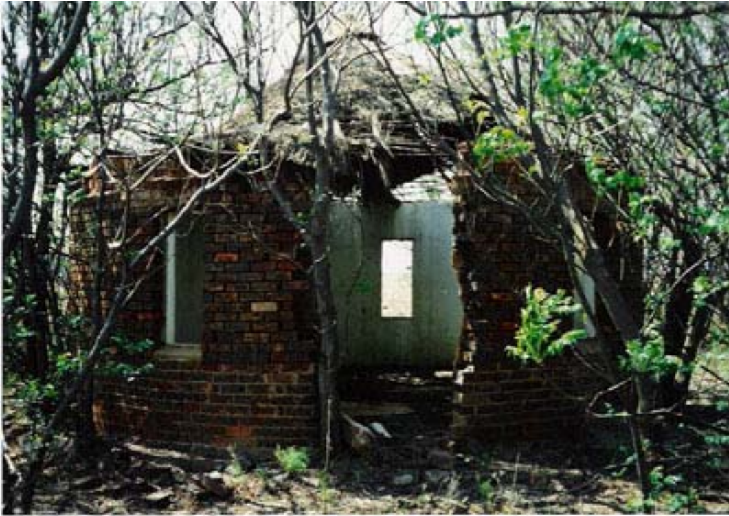
Abandoned Vertrekker homestead, exterior, made of home-fired brick and thatch