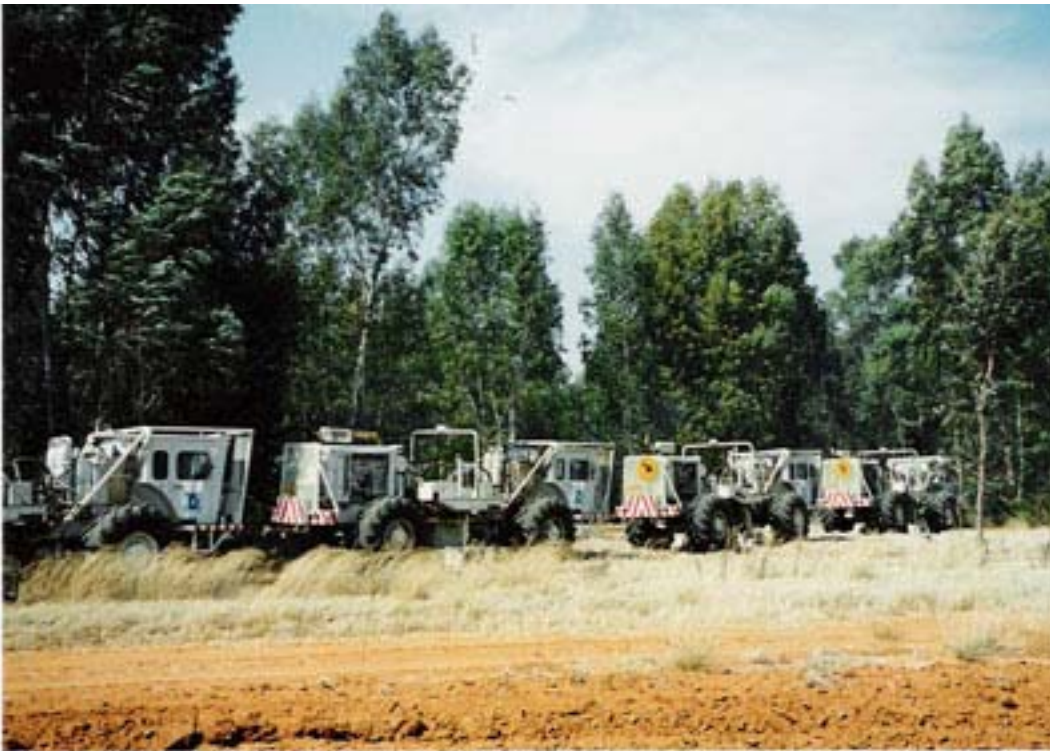
Vibroseis in SA would be boring as hell except for all the damn snakes, three men electrocuting themselves, and being caught in a taxi driver riot