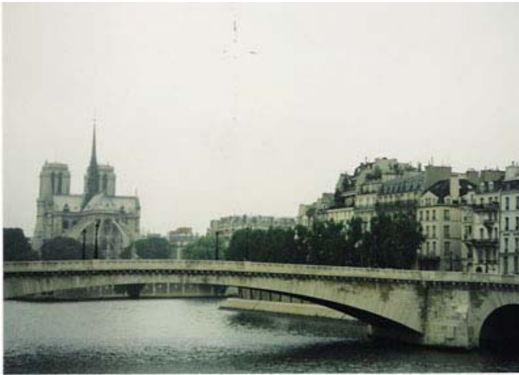
A Compagnie General du Geophysique - A 'voir! You guys are the best