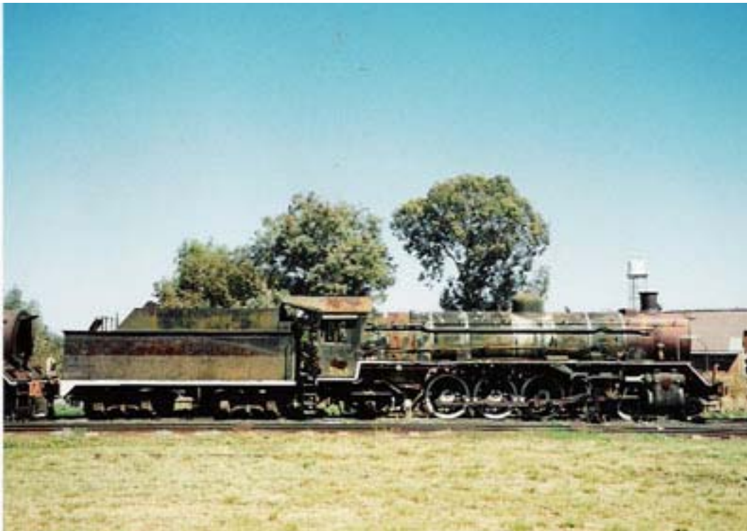
Grande Dame in her senescence