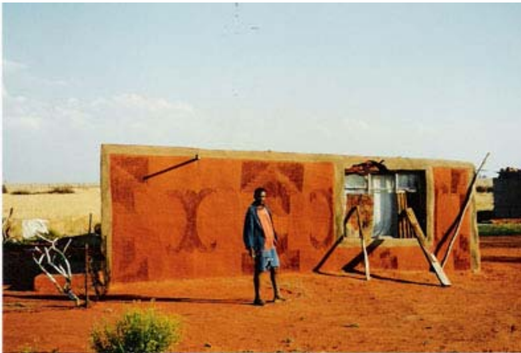
Another house, this one with magical signs on the stucco, invocations and supplices to the god of a new South Africa