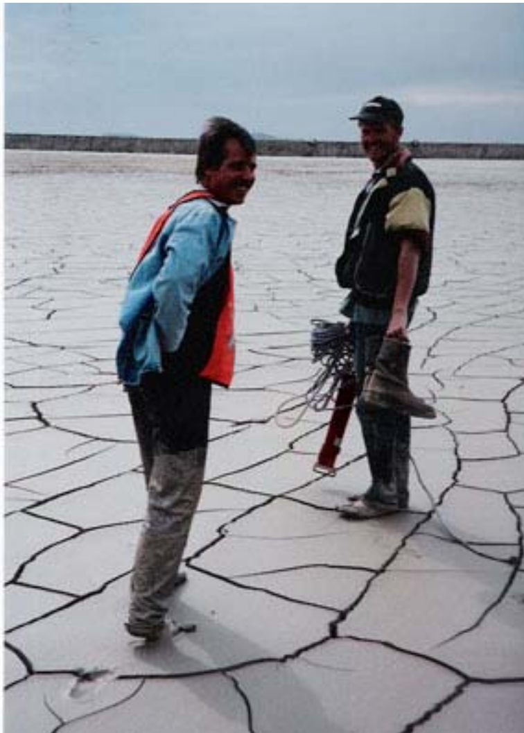
Another benefit for working for CGG - meeting a real range of people on the crews - an Algerian and a Brit