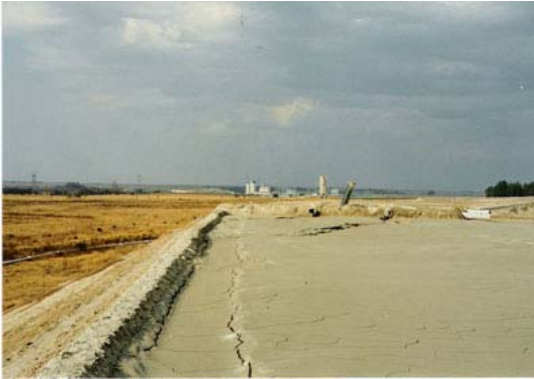
The settling ponds are contained by enormous walls (1) a hundred feet tall, or more