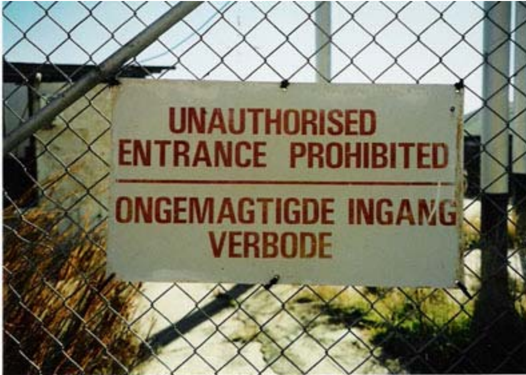
Contract was for Anglo-American Gold and they Were deadly serious about the warning.