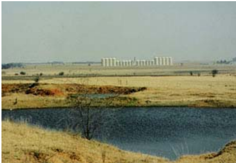
The Orange Free State looks a lot like Kansas