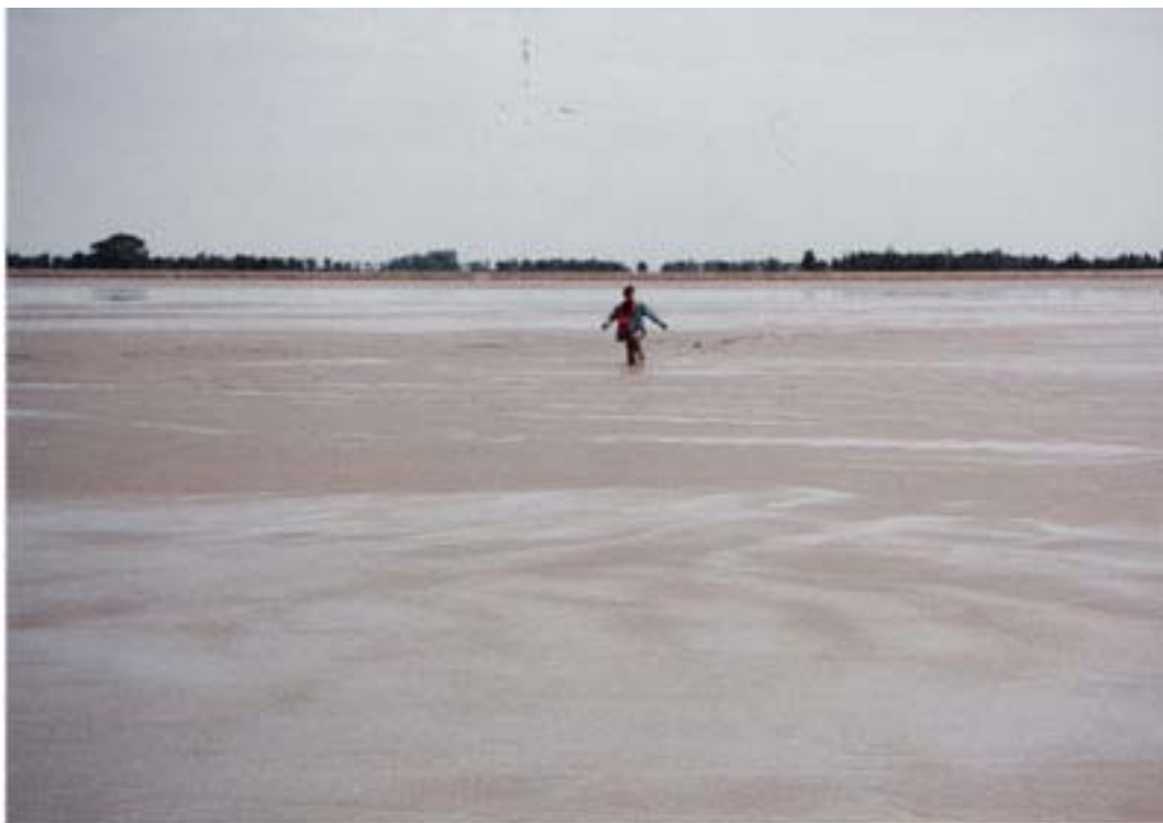
When the gold is removed from the slurry it is then pumped into enormous settling ponds that we had to cross with our seismic cables and phones