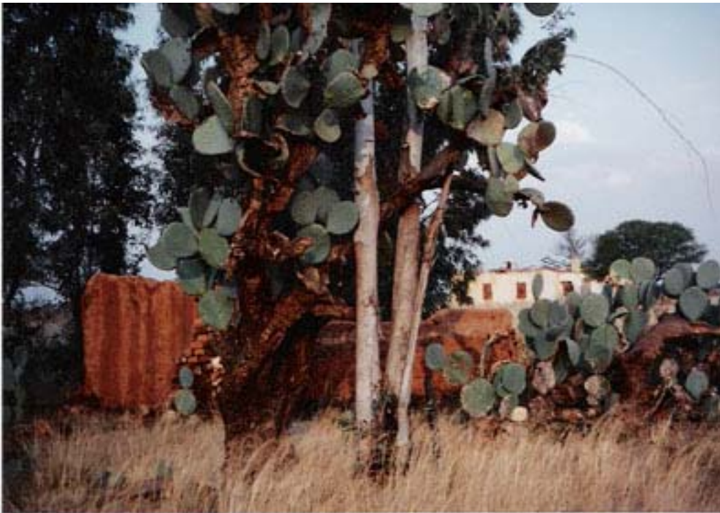
Another visual metaphor, if I may