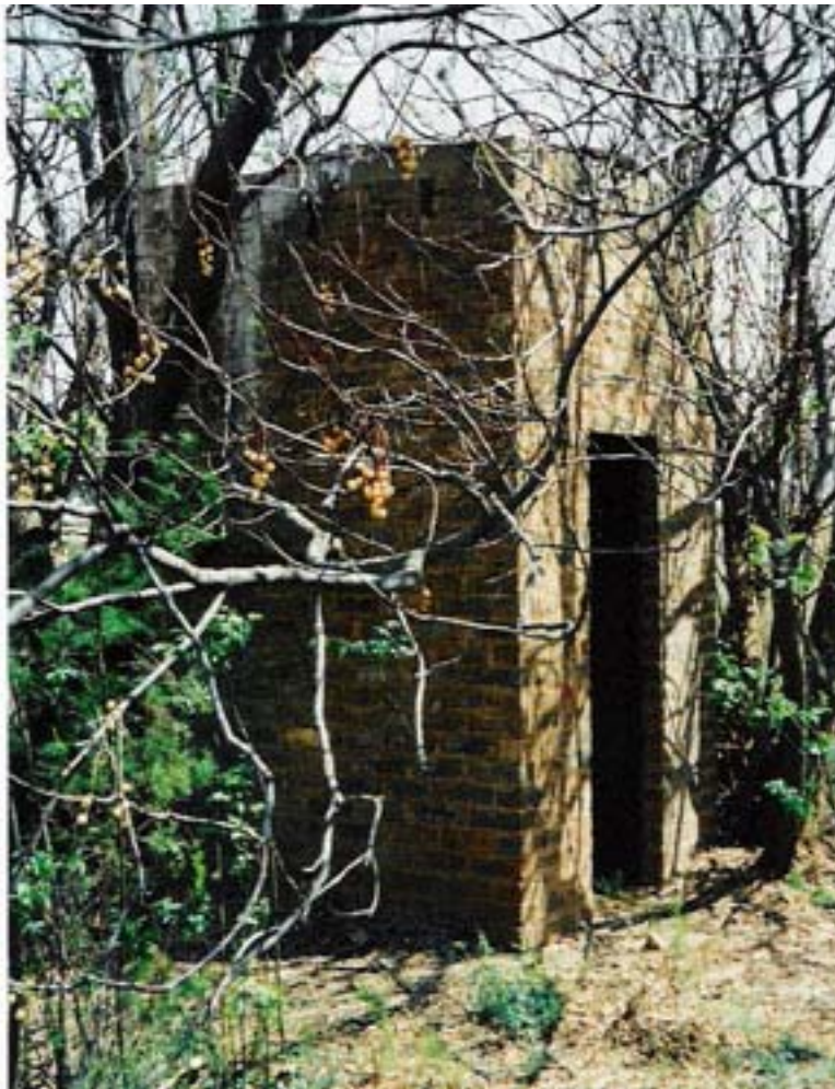
Outbuilding (cobra heaven)