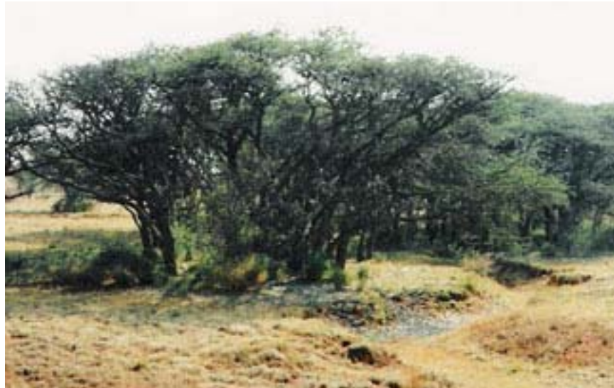
Typical non-agricultural terrain - thorn trees and outcrop of quartzite rock that includes occasional veins of gold