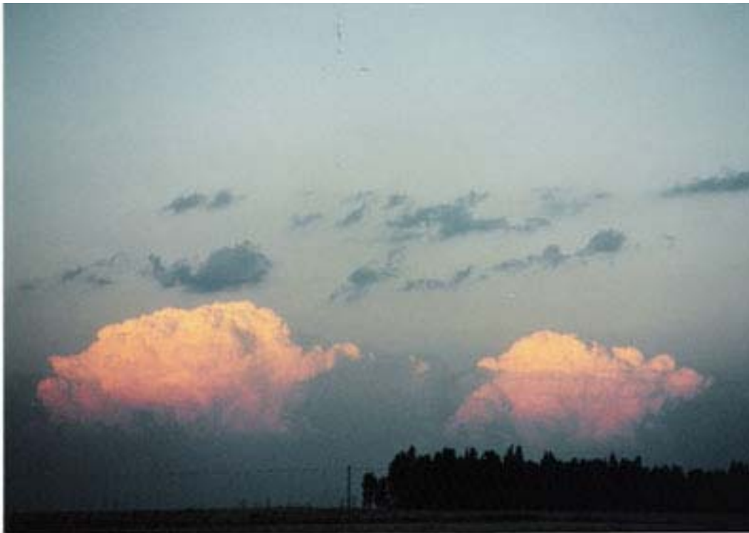
But another beautiful, beautiful country in a beautiful and exciting life!