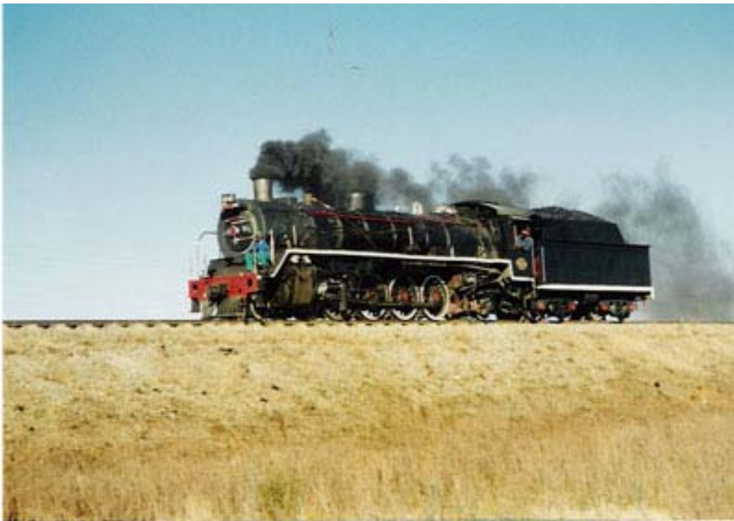
And coming back, balls to the wall!