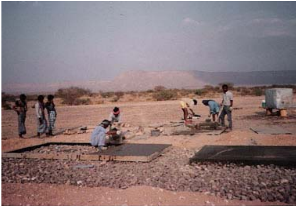
One of the towns in Wadi Ghardan