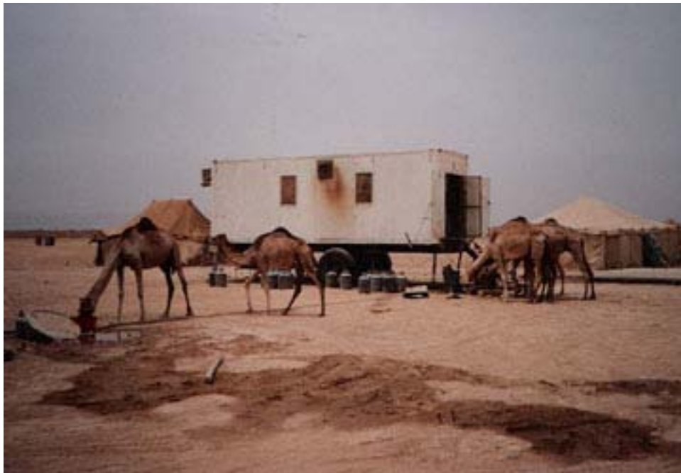
Scavenger camels cleaning up around the laborer's kitchen trailer