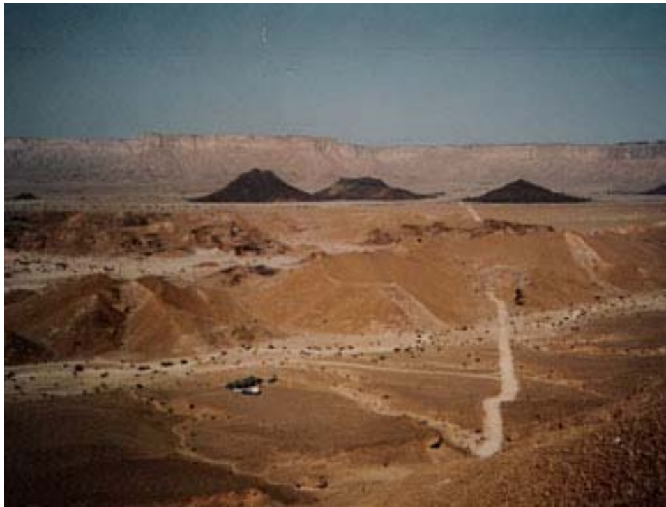
One of only three roads that provide access to the world on top of the escarpment The home village of Usama bin Laden is not far from here