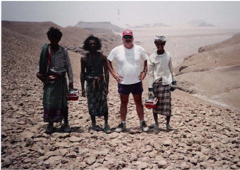
Typical Base Camp scene