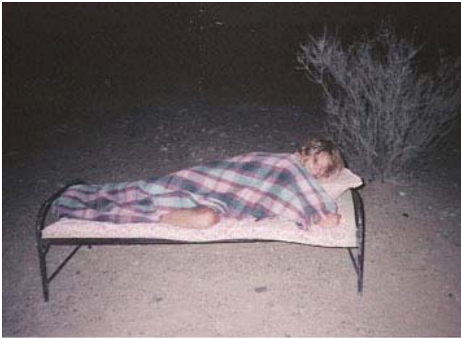
Tribal night askari (guard)