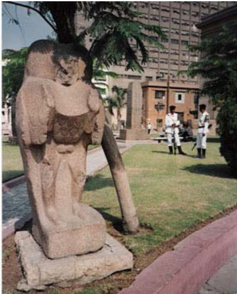
Statue of Osiris In front of the Egyptian National Museum