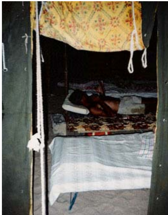
Fly camp bedroom