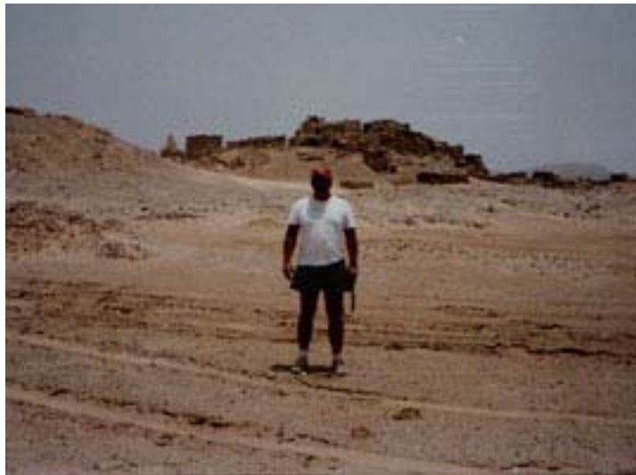
A typical mountain town with defensive gun tower