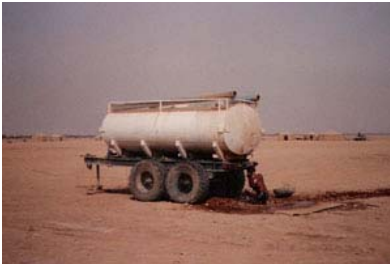
Taking a "shower" in labor camp