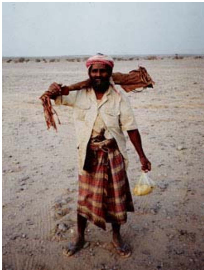
Crew's militia askari

They shot three of my men before I got the testosterone problem solved