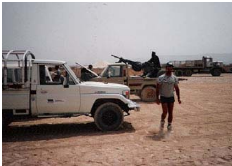
Chauffeur with jambiya