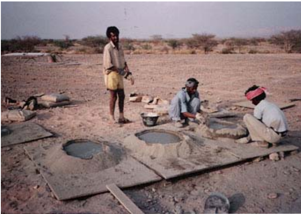
Site of a pre-Biblical salt mine See my poem Inshallah in the Poetry file