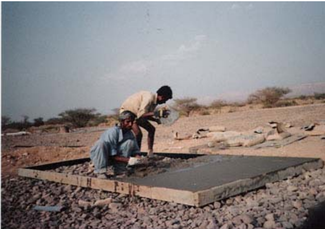
Me in my element, waiting to receive the end of 5000' of cable from the helicopter