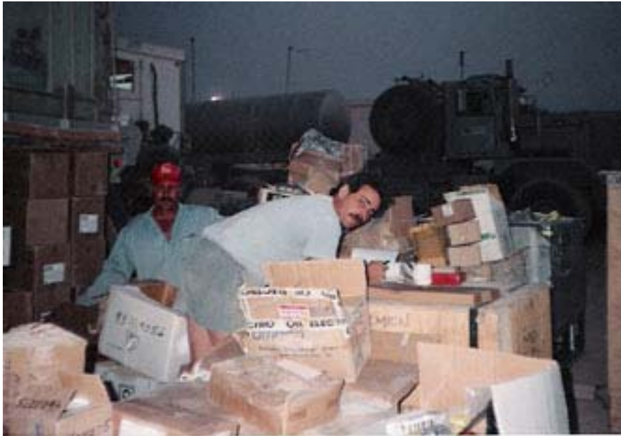
The corner gas station