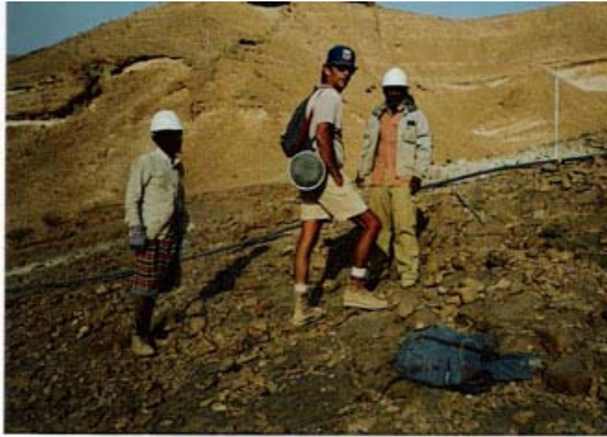
At the lost city of Shabwa the summer home of the Queen of Sheba