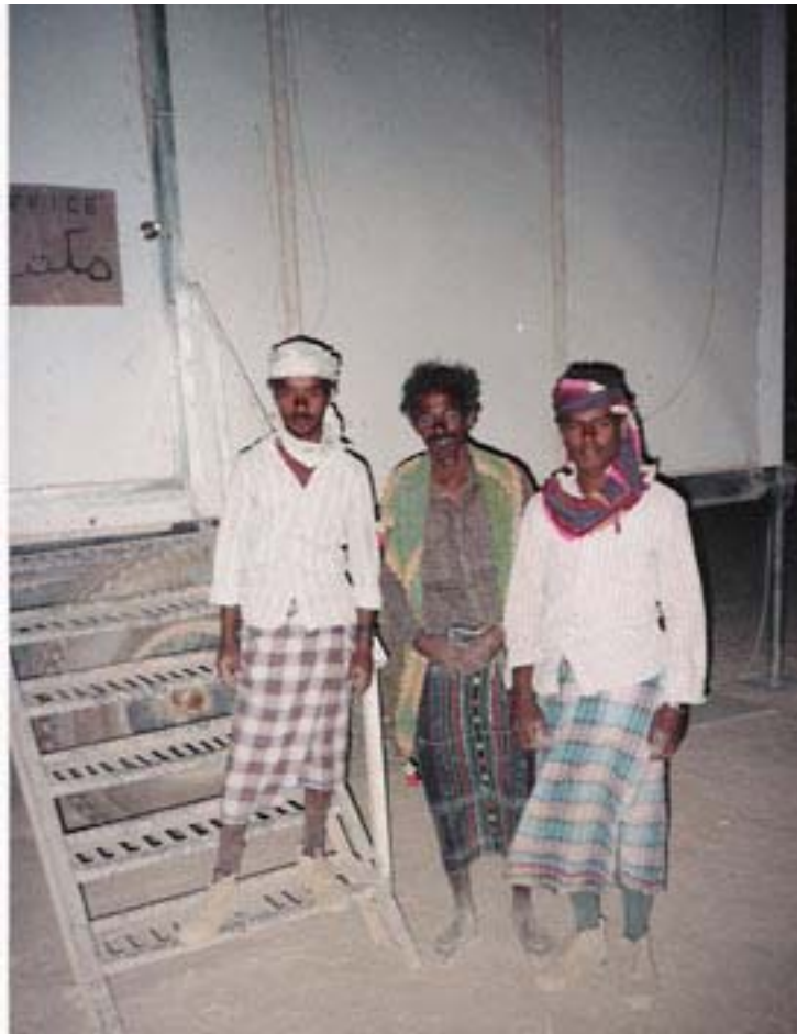
Some of the guys from the labor camp