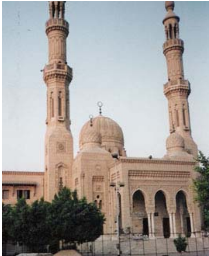
Major mosque with twin muezzin towers