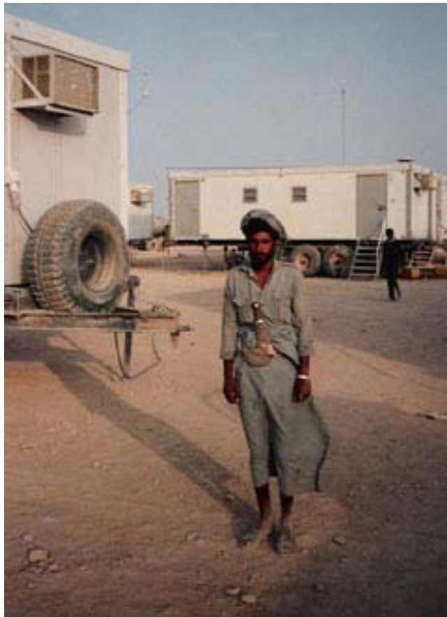
Putting up tents in the labor camp