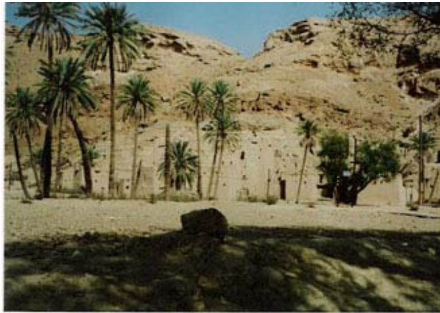
My main man Sh'kib and an Eritrean who walked fifty miles across the desert in 125 degree-plus heat to find a job