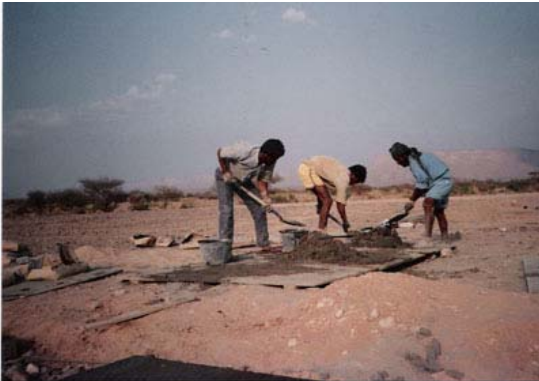
View from the top of the jebel to the end of a seismic road that is one vertical kilometer mile below. We strung cable from there to the top of the scarp by helicopter