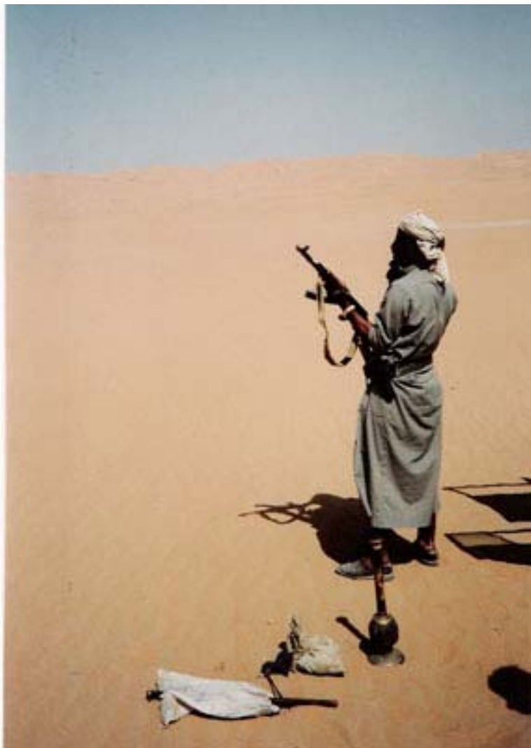
Smoke break monitor