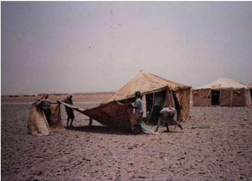
Base camp. Note "Technical" in rear with Russian-made machine gun The great-great grandfather of the guy in the shorts killed Sheriff Pat Garrett in New Mexico