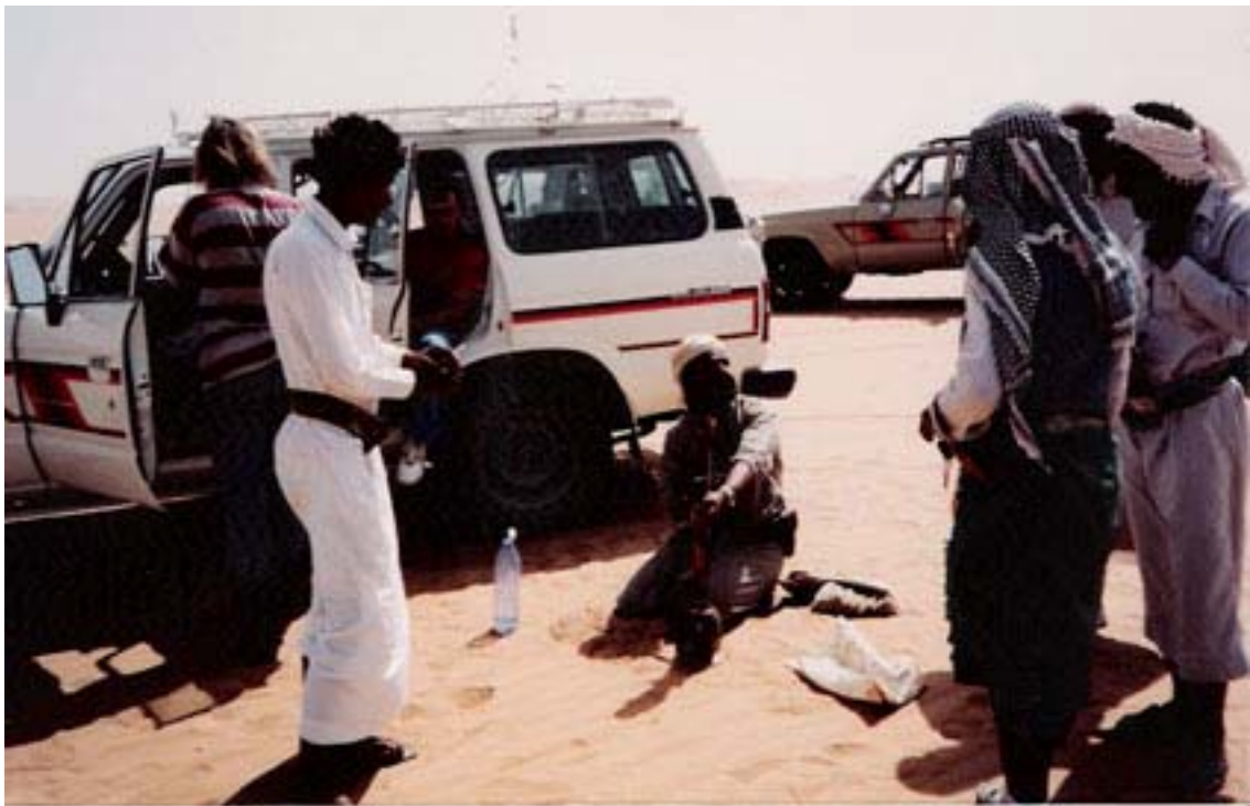
Bullshit session beside the track at 125 degrees