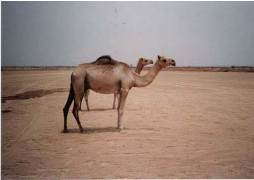
Don't feed the bears!