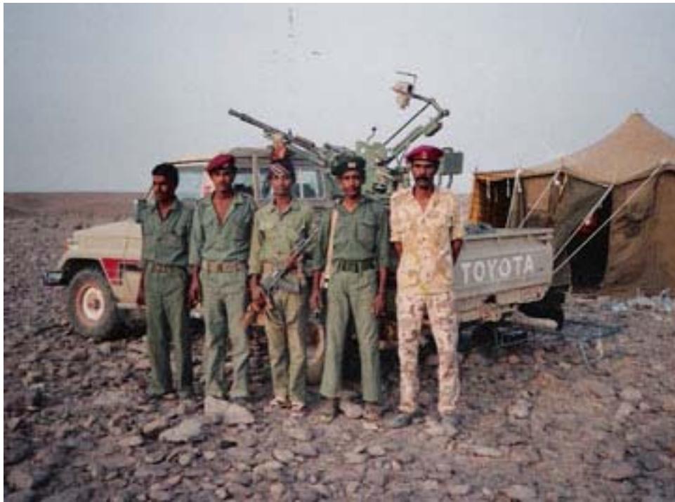
"Technical" and gunner with anti-aircraft gun the askari used on bandits and their Toyotas