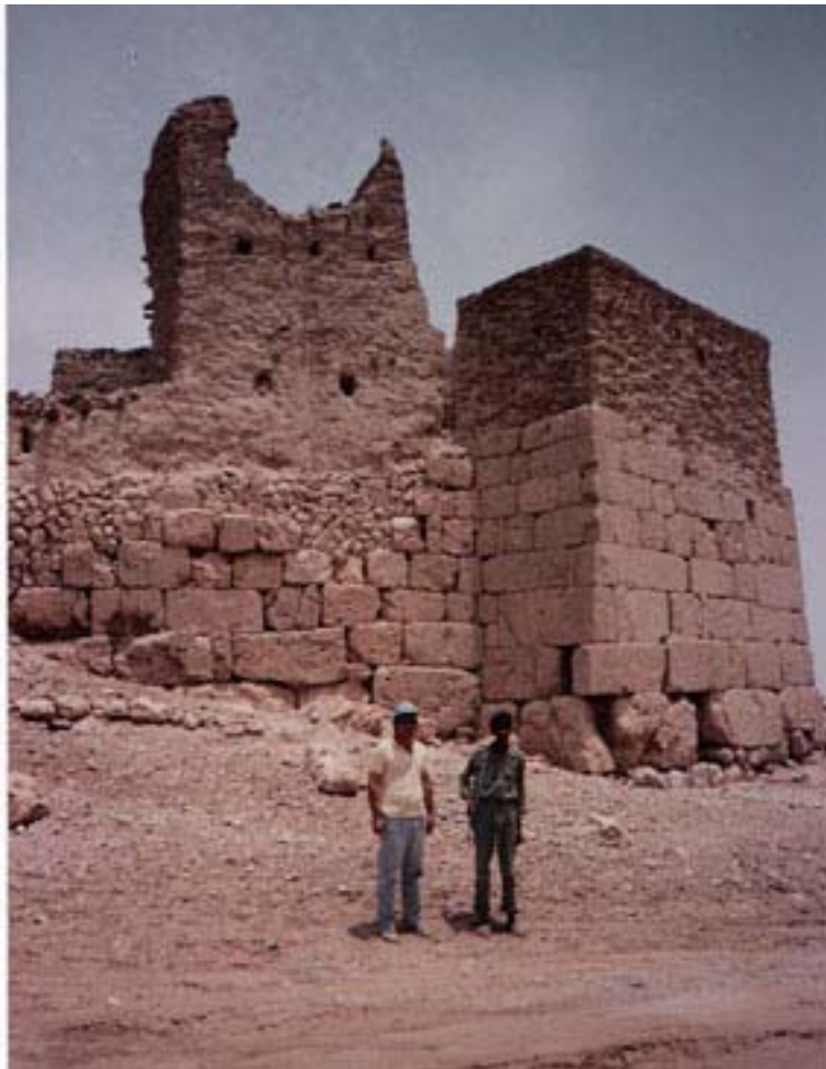
A local sheikh taking young camels to market in Atak He had fourteen children by four wives and I tagged him with the nickname bindook kwayis