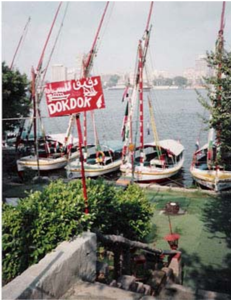
Tourist boats in Cairo