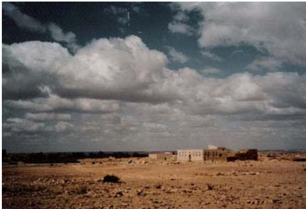
A sheikh's palace in Wadi Ghardan