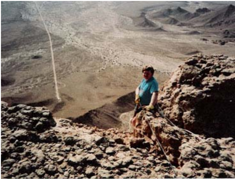
Me with two wild bedoo tribesmen and one tribal-affiliated helper