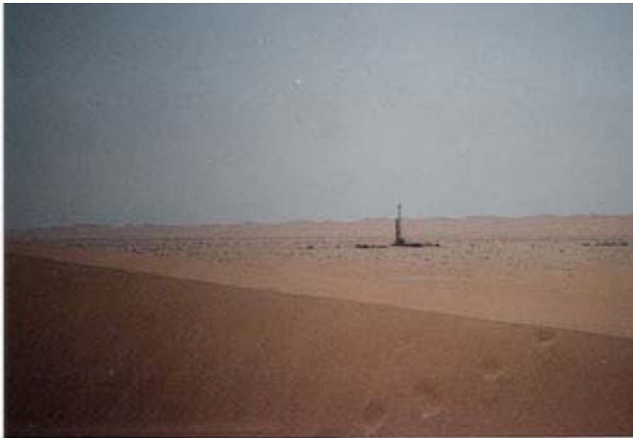
Hunt Oil rig