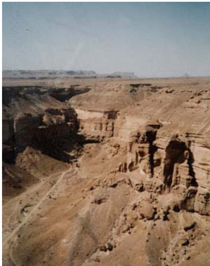
Mixing cement in the time-honored Third World way