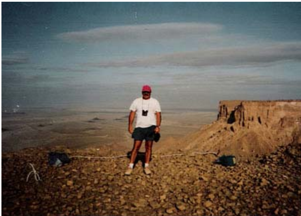
Local tribesmen stop by to observe us building helicopter landing pads in quarter sections then filling the + in the middle with cement. Very efficient method I invented We used water from the tank on the right and sand from a nearby wadi