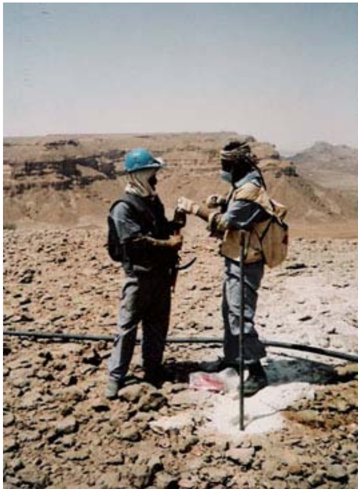
My crew and a finished helicopter pad