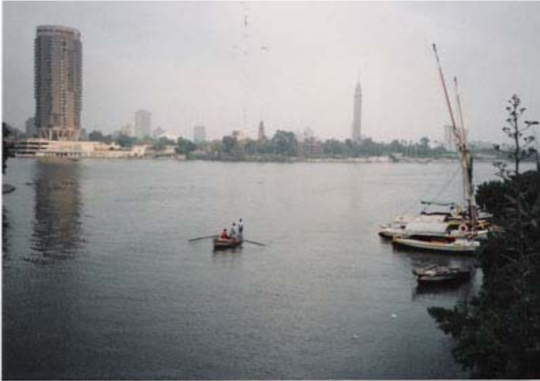
The Nile River at Cairo