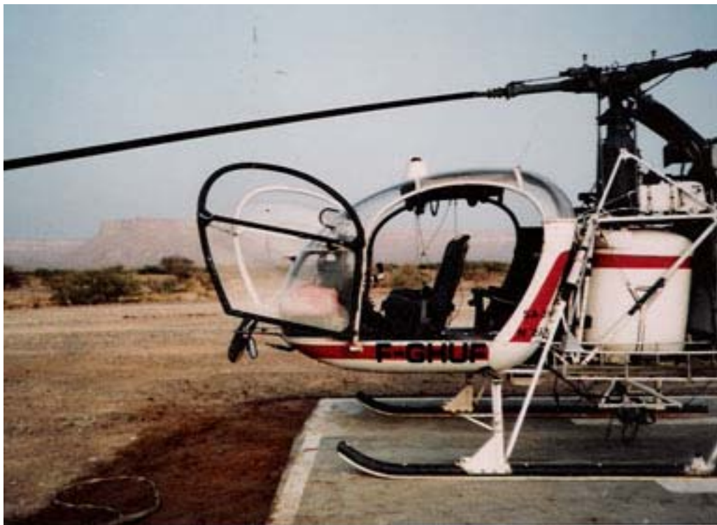
Typical geology of the area