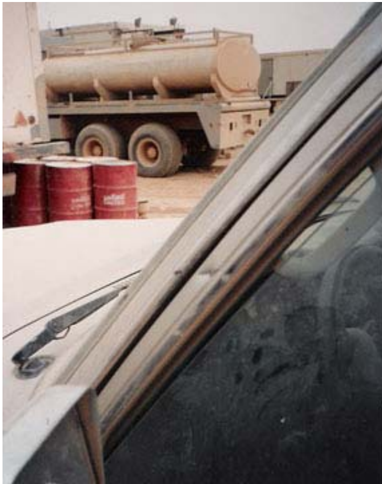
Heli Union Lama in front of the enormous escarpment we were exploring