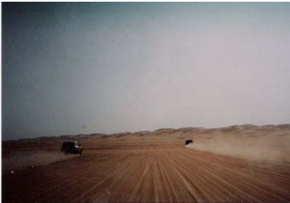
Across the Yemeni desert at 80 mph from Ma'arib toward the Atak District