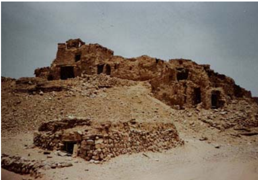
A lovely antique defensive door in mountain village