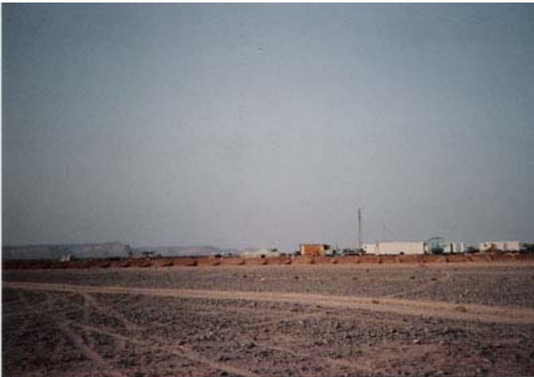
Base camp behind defensive revetment