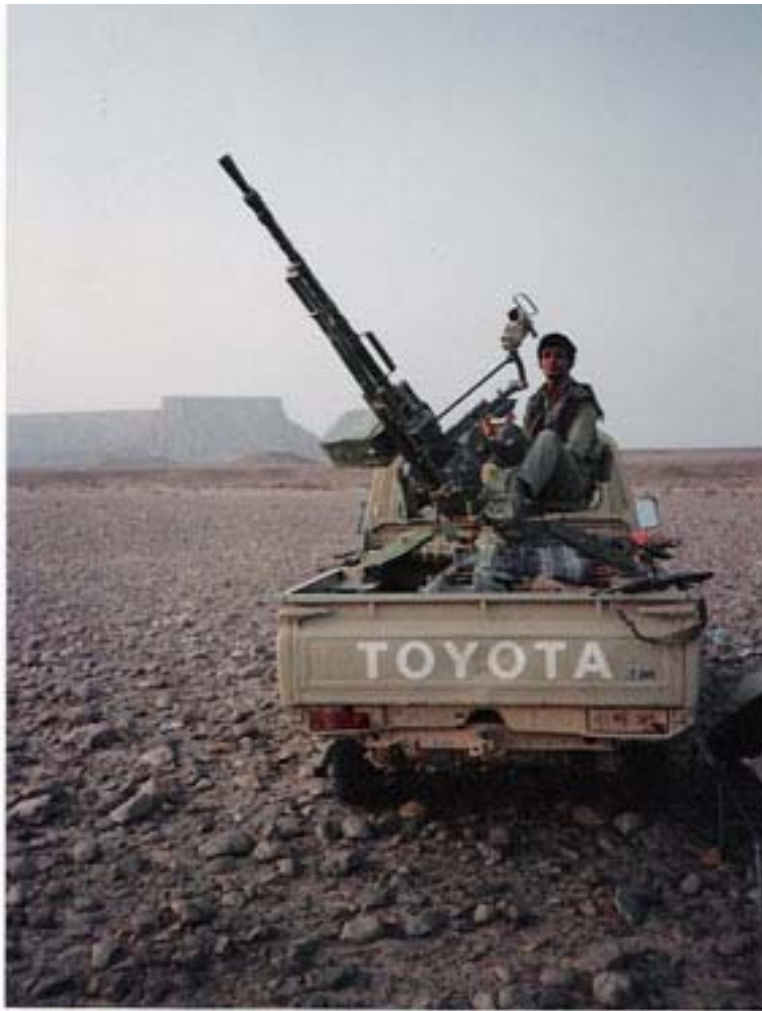
"Near Miss" accident - mark from sniper round on my company Toyota truck. I made the mistake of throwing a rock at some boy thieves at a fly camp then driving by their village the following day