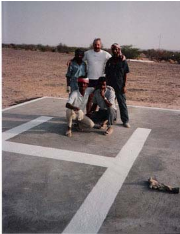
The Palace of the Caliph, Shabwa