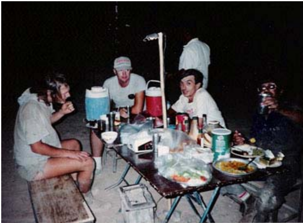
Evening meal in Fly camp Men (L to R) are from Scotland, Canada, Malta and Pakistan