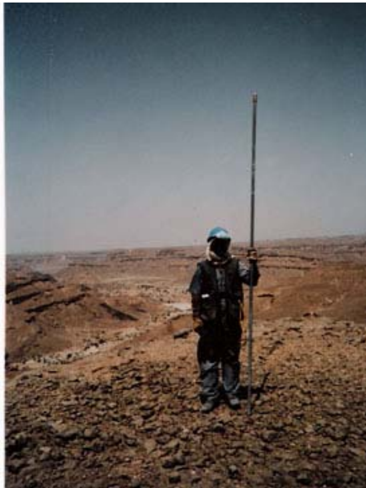
The partially-excavated city of Shabwa Local tribesmen say that the French began excavation with toothbrushes and the Russians finished the work with bulldozers